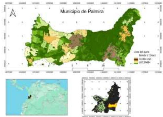
Figure 1. Location of the municipality of Palmira, Valle del Cauca, Colombia

territory there are several important tributaries and sub-basins, including the Amaime and Bolo river basins, which originate on the western slopes of the Central Cordillera and drain into the Cauca River.