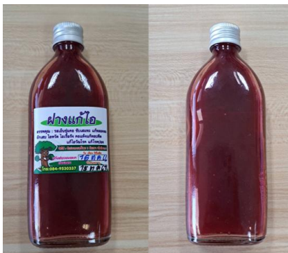
Figure 2. Fang herbal cough remedy (developed by the authors)

Galangal exhibits antibacterial properties, making it effective against respiratory infections [8]. Black peppercorns relieve cough, expel phlegm, and treat cold. Orange peel aids in settling sediments in the digestive system, which can indirectly support respiratory health [15]. White lime powder from clamshells helps expel phlegm and is effective in expelling phlegm; thus, clearing airways Phimsen reduces coughs, expels phlegm, and has anti-inflammatory properties. Menthol relieves coughs and reduces throat inflammation, and camphor helps relieve cough and reduces throat inflammation. Camphor helps expel phlegm and keeps the throat moist [8]. According to [16], a comparison of the results of formularies Fang syrup and brown mixture, the cough in upper respiratory tract infection patients found that the use of fang cough syrup and black cough syrup to reduce the severity of cough in patients with upper respiratory tract infection had a statistically significant difference of 0.05. The results of this study are good for using herbal products to replace modern medicines to increase their use to create domestic self-reliance and reduce the import of drugs and chemicals from abroad, which is beneficial to the health of the people in the country.