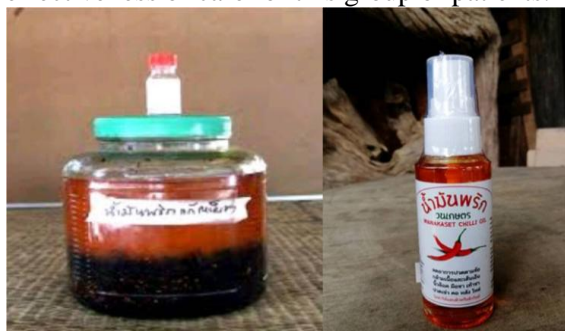
Figure 3. Chili oil (developed by the authors)

inflammation and swelling; and relieve muscle pain. Capsaicin in chilies Capsaicin, found in chilies, acts as a counterirritant, providing relief from joint pain and muscle aches [17]. Topical application of capsaicin has shown significant efficacy in reducing chronic pain, with studies indicating a 60.8% response rate in patients with non-specific back pain [18]. Coconut oil moisturizes the skin through its moisturizing properties and enhances skin health. Wintergreen oil is effective for mild pain, including arthritis, and the muscle strain camphor is recognized for its ability to ease muscle and joint discomfort. Wintergreen oil relieves mild pain, such as joint pain, muscle aches due to strain, sprains, arthritis, bruising, and back pain [13, 17]. According to [18], concerning the development of medicinal herbs from the extract of chili and phlai in emulgels, the innovation of herbal medicinal products in the formula helps care for patients with muscle pain and inflammation related to nerve issues. This approach enhances patient compliance with treatment and reduces the risk of side effects associated with conventional medicine, thereby significantly improving the effectiveness of care for this group of patients.