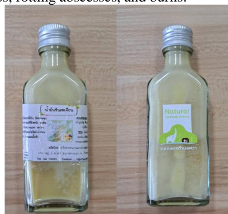
Figure 1. Aromatic litsea oil (developed by the authors)

essential oil against the waxberry spoilage fungi Penicillium oxalicum and its potential application revealed that the combination of Litsea cubeba (Aromatic litsea) and Coptis chinensis (Chinese goldthread) resins presents a promising approach for treating various types of wounds, particularly burn wounds and infections. Litsea cubeba exhibits broad-spectrum antibacterial properties, effectively compromising bacterial cell membranes and promoting wound disinfection. This mixture is particularly effective for treating burn wounds, scalds, blisters, infected wounds, and wounds with pus. According to the Farmer Development Group and Leader Network [12], aromatic litsea oil can be used to treat ruptured abscesses, rotting abscesses, and burns.