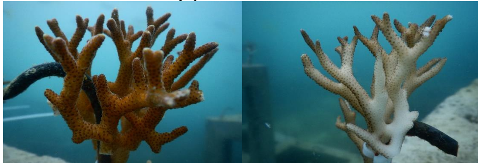
Fig. 3 Living Acropora sp. (a), dead Acropora (b)

The field observations showed that live Acropora was characterized by bright and diverse colors, opposite the dead corals were characterized by pale